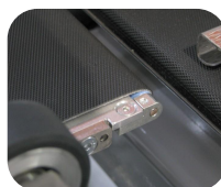
Closing conveyor for small length product 6" or less, also for multi-packs